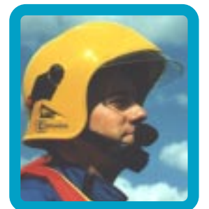
GALLET F1E Fire Fighter's helmet