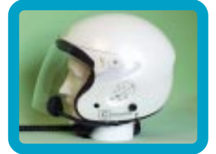
DELTA+ ultralight protective helmet