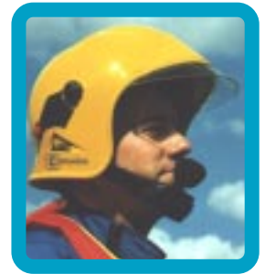
GALLET F1E Fire Fighter's helmet