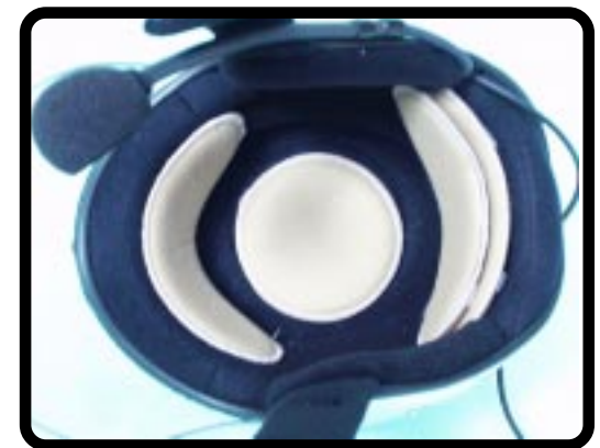
For 54cms head, fit 4 pads