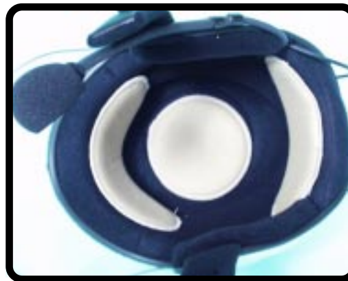
For 56cms head, fit 3 pads