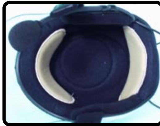
For 58cms head, fit 2 pads