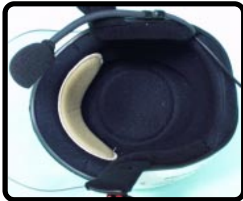
For 60cms head, fit 1 pad

For 62/64cms no pads are needed and the pad fits below are suggested for fitting smaller heads:-